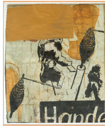
Neo Rauch. Hände. 1993 Oil and shellac on paper, collaged, on canvas. 145.5 × 123 cm EUR 100,000–150,000