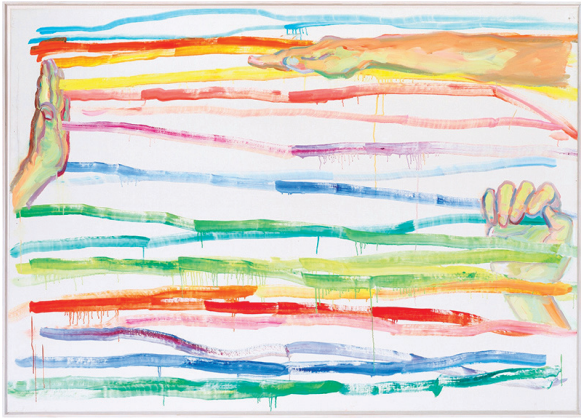
Maria Lassnig. Hände. 1989 Oil on canvas. 145 × 205 cm EUR 180,000–240,000