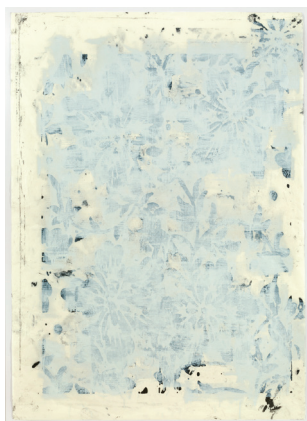
Christopher Wool. Untitled (D 64). 1998 Alkyd on rice paper. 167 × 120 cm. EUR 300,000–400,000