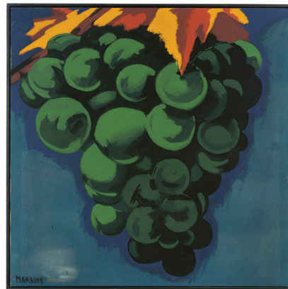
Markus Lüpertz. Weintraube. 1971 Distemper on canvas. 200 × 200.5 cm. EUR 100,000–150,000