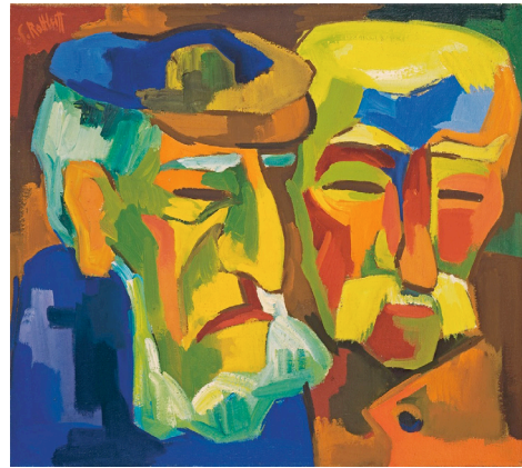
Karl Schmidt-Rottluff. "Pommersche Bauern". 1924 Oil on canvas. Estimate EUR 400,000–600,000