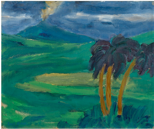
Emil Nolde. "Südsee Landschaft II". 1915 Oil on canvas. Estimate EUR 800,000–1,200,000