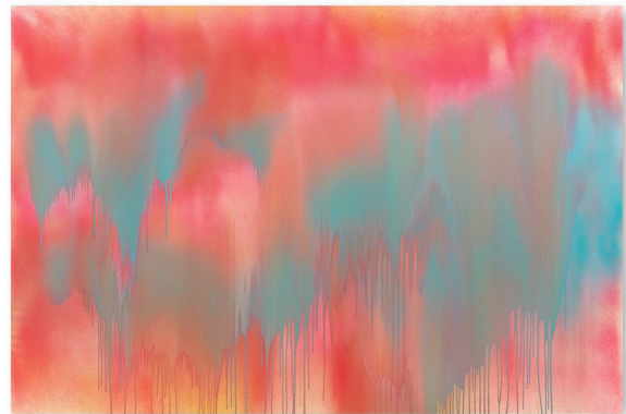
Katharina Grosse. Untitled. 2000 Acrylic on canvas. Estimate EUR 200,000–300,000