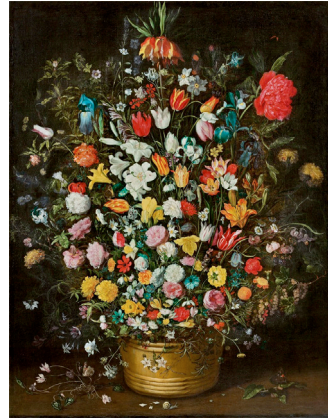
Jan Brueghel d.J. "Großer Blumenstrauß mit Kaiserkrone im Holzbottich". Circa 1625/30. Oil/canvas. Estimate 800,000–1,200,000