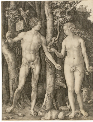
Albrecht Dürer. "Adam und Eva". 1504 Copper engraving on laid paper. Estimate EUR 80,000–120,000